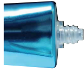
D30 Flat Oval