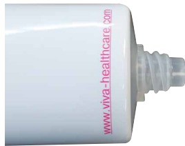
D48.5 Round Oval