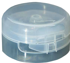
Tamper-proof Fliptop Cap