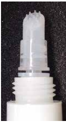
Doe foot Scrub (Silicone) Part : Scrub