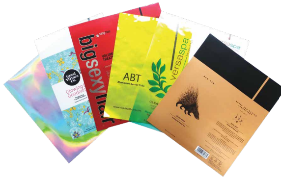
Pre-print IML Label