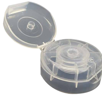
Vented Low Profile Cap