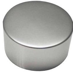
Metal Overshell Cap