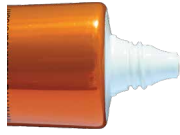
D30 Round Oval