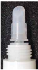
Doe foot with 1 hole (Silicone) Part : Foot1 (with or without spring)