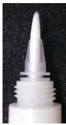
Lip brush (PBT) Part : Brush