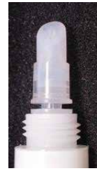
Doe foot with 4 holes (Silicone) Part : Foot4