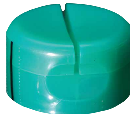
Tamper-proof Shrink Sleeve