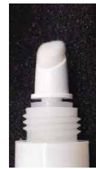
Flocked doe foot (Hytrell + 1405M) Part : Flock