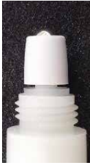
Metal Ball Part : Ball