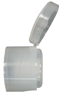
Orifice~ 3, 5, 6mm