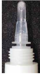
Spatula (TPR) Part : Spatpr