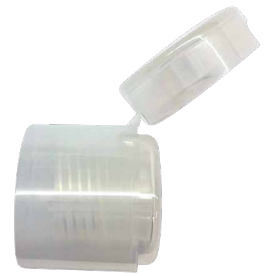
Orifice~ 1.5, 3, 5, 6mm