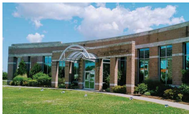
Toronto, Canada (2 plants)