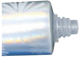
D38.5 Round Oval