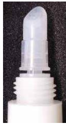
Doe foot with 5 holes (Silicone) Part : Foot5