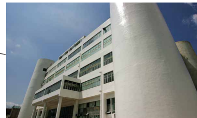
Hong Kong, China (HQ)