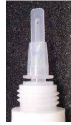
Spatula (Silicone) Part : Spa